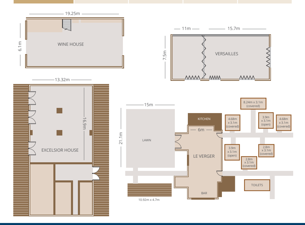
SEATING LE VERGER 40 pax 80 pax 100 pax 20 pax 20 pax 20 pax 40 pax 100 pax 80 pax 100 pax 120 pax 120 pax 20 pax 40 pax 20 pax 50 pax

T: +27 (0)21 876 8900 | E: banqueting@lefranschhoek.co.za 16 Minor Road, Franschhoek 75km from Cape Town International Airport